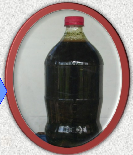
GOAT MANURE TEA