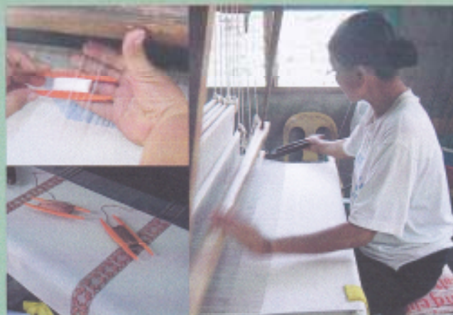
Suksuk Designing and Fabric Production