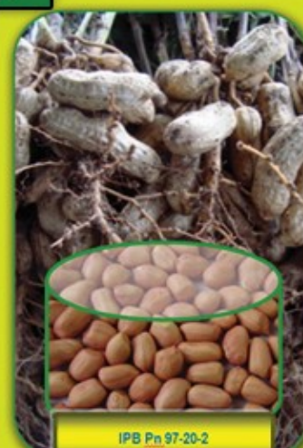
IPB Pn 97-20-2