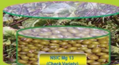
NSIC Mg 13 (Check Variety)