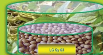
LG Sy 63