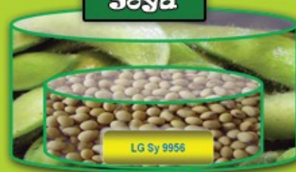
LG Sy 9956