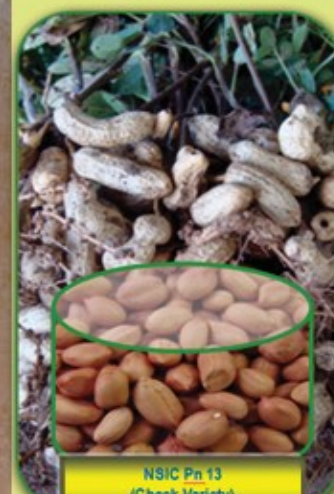
NSIC Pn 13 (Check Variety)